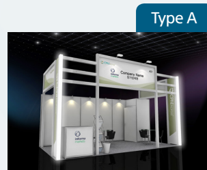
Graphics on top panels